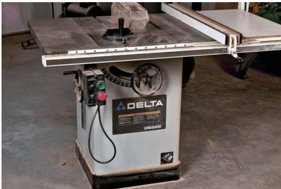
H. table saw