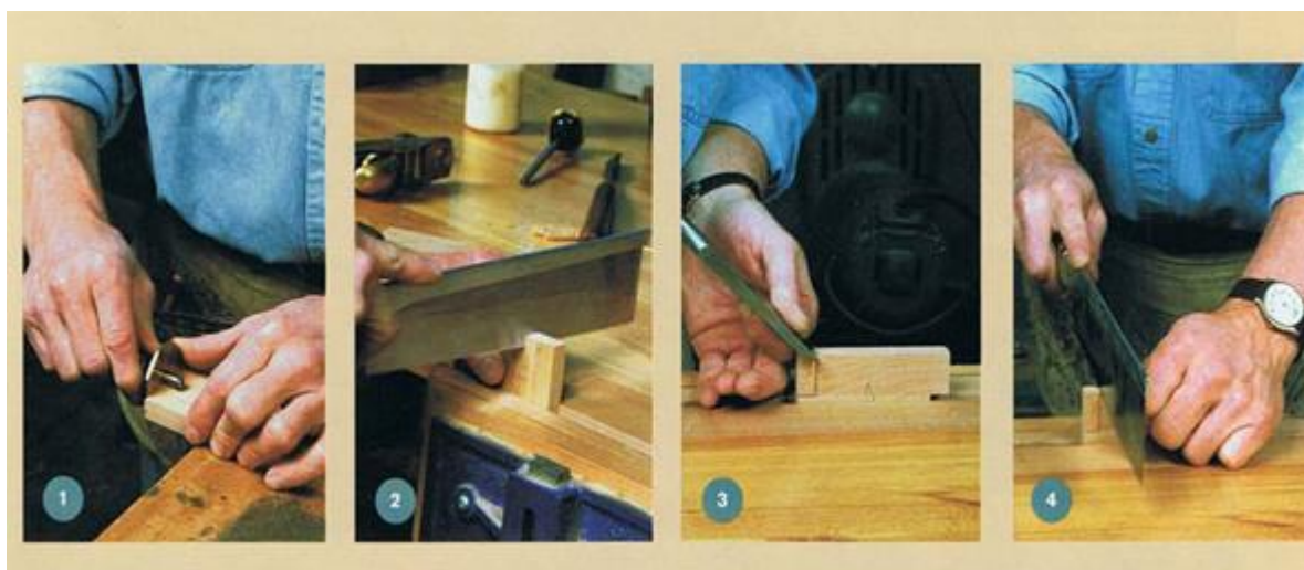
Picture No 21. Box Building with Lap Joints and Rabbets